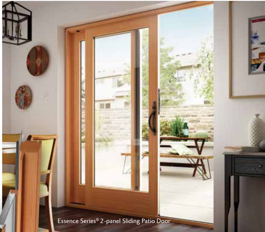
Essence Series® 2-panel Sliding Patio Door