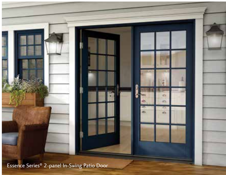
Essence Series® 2-panel In-Swing Patio Door