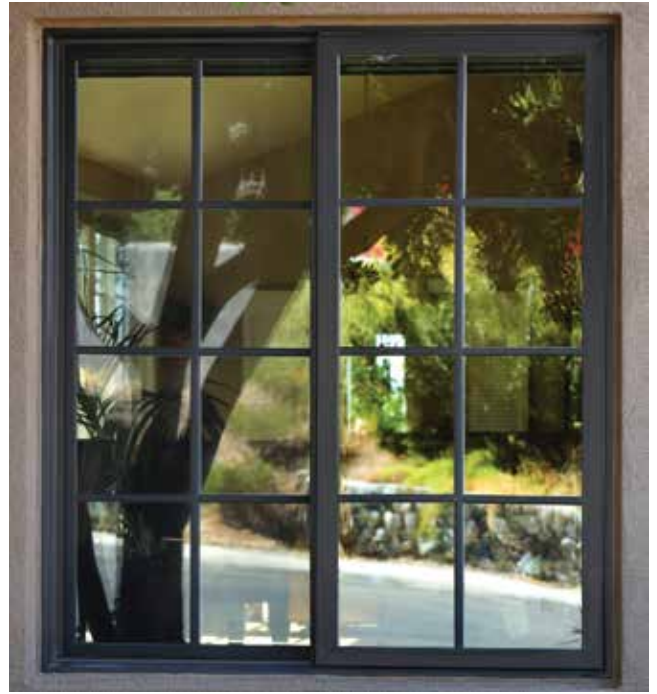
Style Line Series shown in Bronze

Other windows may reflect damaging UV rays, which over time can dull, warp and crack the paint. Milgard Premium Exterior Vinyl Finishes, on the other hand, are translucent. New coating technology allows UV rays to pass through Milgard paint so that the vinyl reflects the UV rays. This preserves the exterior color and finish.