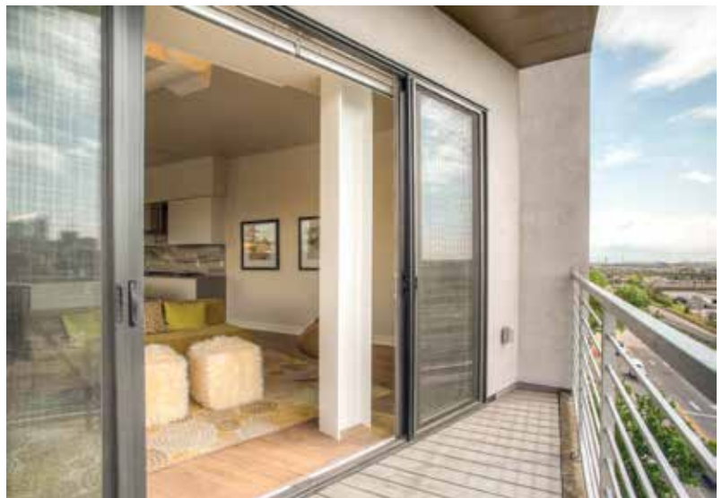
Tuscany Series shown in Tweed

We test for Crosshatch Adhesion, Direct Impact, Humidity Resistance, Cold Crack, Oven Aging and other tests per AAMA 615-13 guidelines. This testing assures you that our Premium Vinyl Finish will stand up to heat, cold, humidity, impact, and weather for years to come.