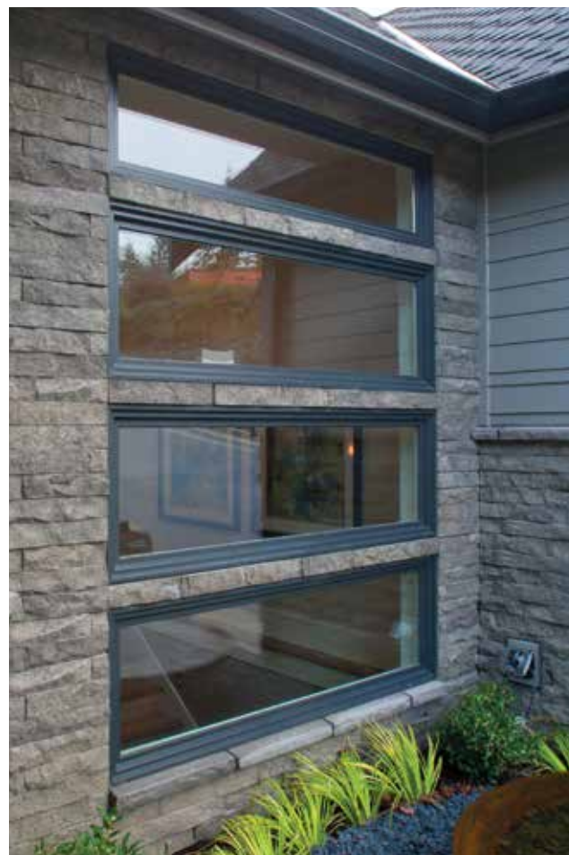
Tuscany Series shown in Bronze