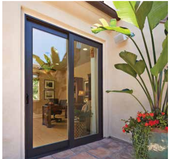
Tuscan Series sliding door shown in Classic Brown

Milgard has paid attention to detail by matching the grids to the frame. Whether you choose flat or sculpted grids between the glass or Simulated Divided Lites, the grids are color-matched to the frame on the exterior and are white on the interior.