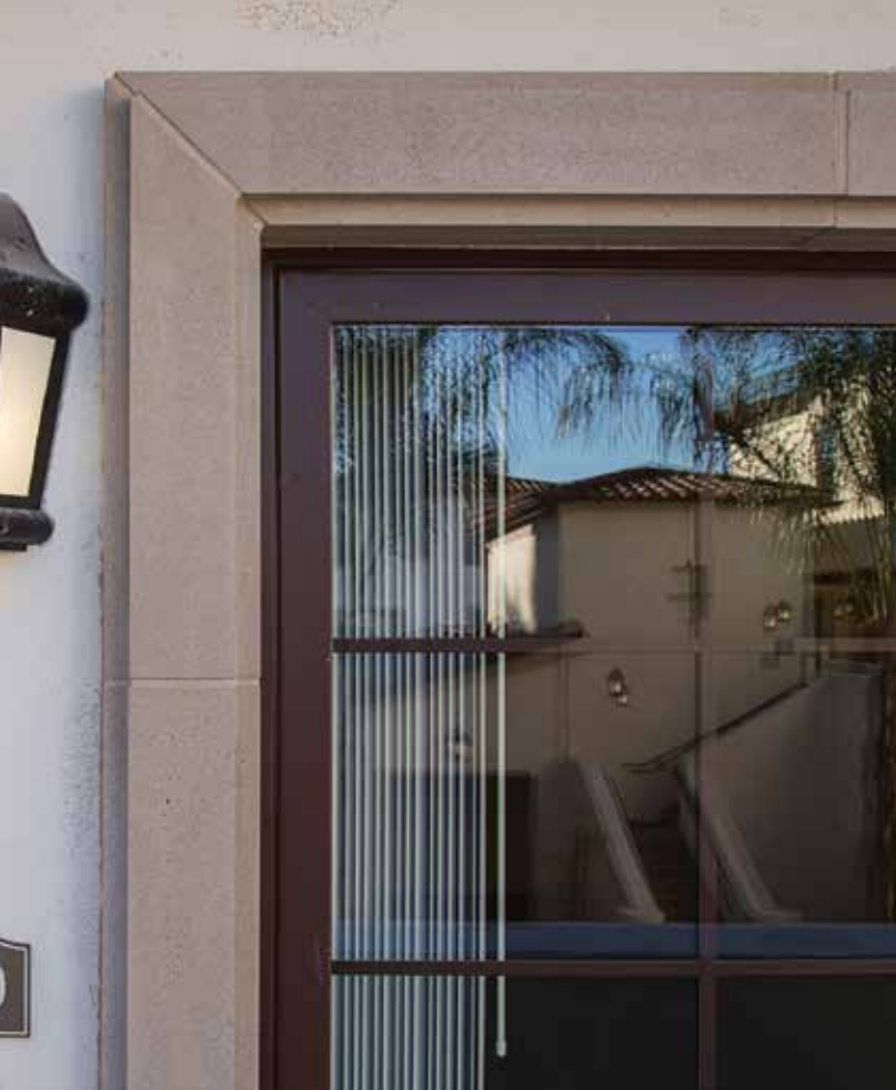
Montecito Series shown in Espresso