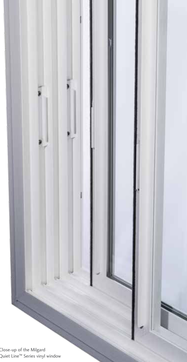
Close-up of the Milgard Quiet Line™ Series vinyl window